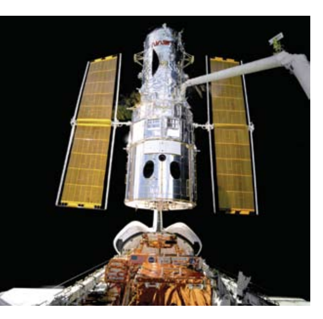
Discovery's robot arm lifts the Hubble Space Telescope out of the payload bay after a successful servicing mission, STS-103, in December 1999.