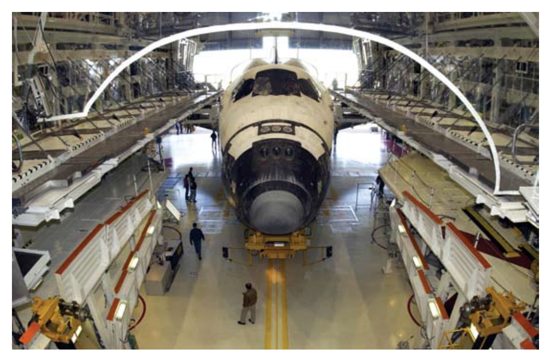
Orbiter Atlantis begins backing out of the Orbiter Processing Facility for rollover to the Vehicle Assembly Building, where it will be mated with the external tank and solid rocket boosters for launch.

Some new facilities were mandatory. A 3-mile-long landing strip was one of the first constructed. The orbiter would land at Kennedy after enough landing experience had been gained on the extra-long, dry lake beds at Edwards Air Force Base in California. A large, highly specialized two-bay building called the Orbiter Processing Facility was constructed near the Vehicle Assembly Building. A few years later, a similar building used as a refurbishment facility was upgraded to become the facility's Bay 3. Spacecraft checkout and assembly facilities were modified to process and integrate a large number of payloads each year. Many other modifications were required throughout the center. This rebuilding and conversion process became the main activity at Kennedy during the years following the Apollo-Soyuz flight.