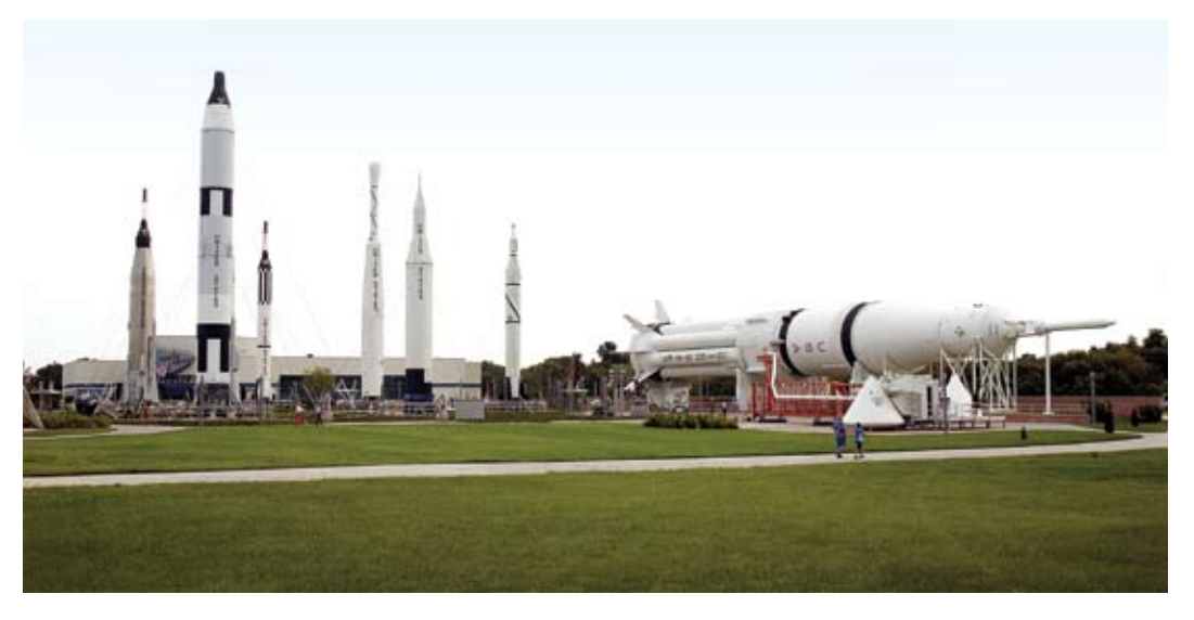
The Rocket Garden at the KSC Visitor Complex features eight authentic rockets from the past, including a Mercury-Atlas rocket. The garden also features a climb-in Mercury, Gemino and Apollo capsule replicas, seating pods and informative graphic elements.

The KSC Visitor Complex is located 45 minutes east of Orlando on S.R. 405 (accessible from U.S. Highway 1, S.R. 3 and I-95). The Visitor Complex is operated for NASA by Delaware North Parks Services of Spaceport, Inc. For more information, call (321) 449-4444 or visit www.kennedyspacecenter.com .