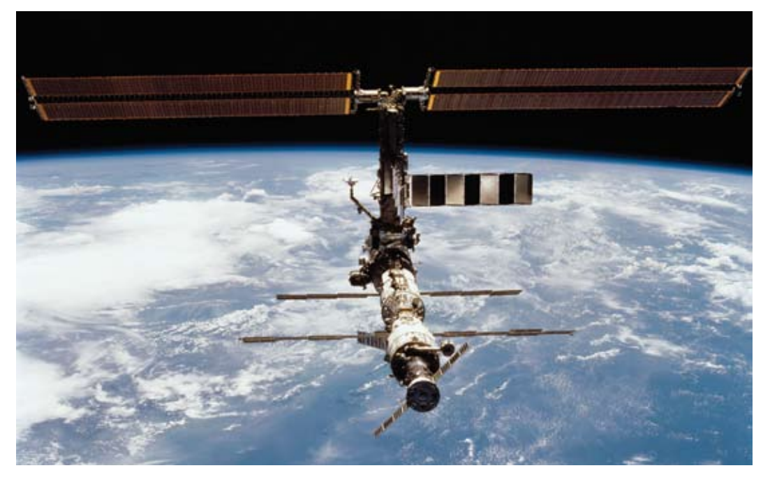
Backdropped against water and clouds on March 18, 2001, the International Space Station is separated from Space Shuttle Discovery after several days of activities and an important crew exchange. One of the astronauts aboard Discovery took this photograph from the aft flight deck

On the commercial side, satellite communications now provide several billion dollars in revenue each year, and continue to steadily grow. These spacecraft fly primarily on unmanned vehicles but the space shuttle did place several in orbit. The ability of a single transponder (on a satellite often providing 30 or more) to bring television into every home in most countries is unique to the space program. Satellite observations and the data they produce, such as