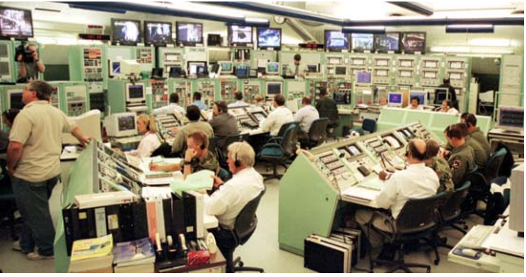
In the blockhouse on Launch Complex 36-A, Cape Canaveral Air Force Station, members of the NASA-industry launch team make final checks before launch of the GOES-M satellite, one in a series of advanced geostationary weather satellites in service, July 23, 2001.

Some of the more unusual facilities in which people work are the giant Vehicle Assembly Building, one of the largest enclosed structures in the world; the Orbiter Processing Facility, filled with complicated equipment used to prepare shuttle orbiters for flight; Pads 39A and 39B, from which shuttles lift off; NASA-operated space shuttle support